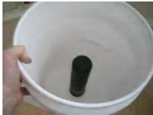
Inside: TOP Bucket With Filter attached