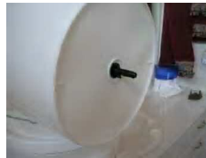
Bottom view: TOP Bucket with the filter nut tightened and the stem sticking through the bucket. The water will drip down & out this stem.