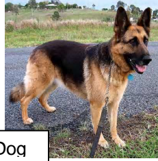
Consider a Guard Dog