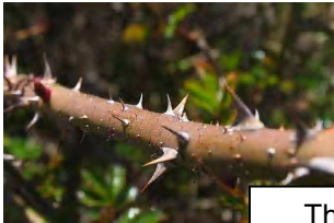
Thorns discourage intruders

1. Outside the home. You will want to consider the perimeter of your property as well as the home itself. Consider the following: