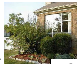
Remove Hiding Spots